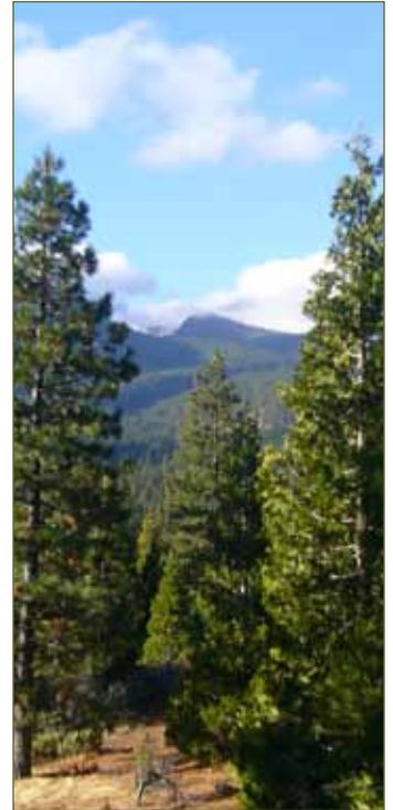
View toward Mt. Eddy.